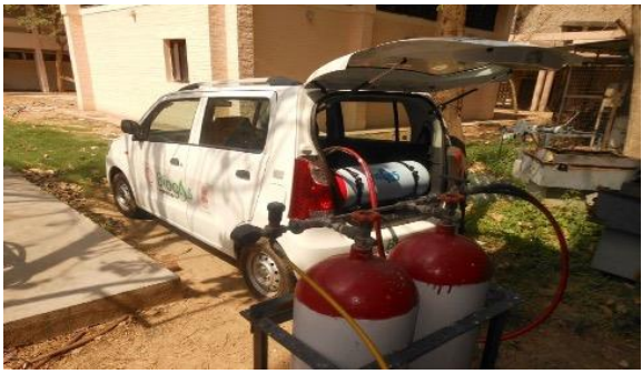
CBG filling in car